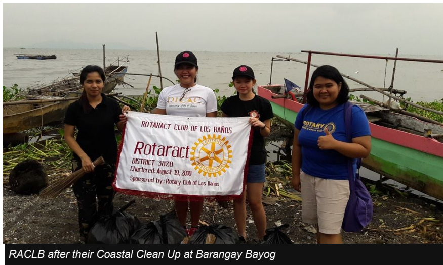
RACLB after their Coastal Clean Up at Barangay Bayog

BAYOG, LOS BAÑOS —The International Coastal Clean up (ICC) is an annual activity by Rotaract Club of Los Baños (RACLB) and other organizations around the world. It is usually done during the 3rd Saturday of September, however, due to adverse weather conditions of the scheduled day and the following Saturdays, ICC was postponed. Although the set date for the activity was already overdue, the Ro-