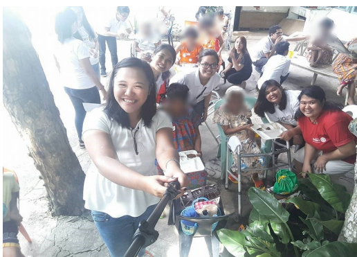
Photo with the elderlies in Bahay ni Maria

Before finally leaving the place, the group held a quick assessment of the