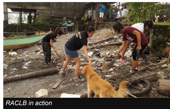
RACLB in action

The women organization of Brgy. Bayog conducts weekly coastal clean up that is usually after their zumba classes. Laguna de Bay is a major water body in Los Baños that provides a lot of ecosystem services in the municipality. Inter coastal clean up is being done to promote a clean and healthy environment.