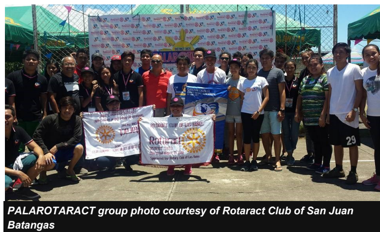
PALAROTARACT group photo

Fellowship with RAC Lucena STI and RAC Caluag happened after the event.