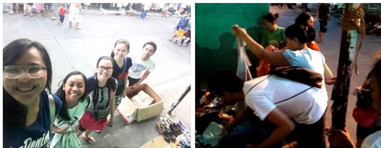
RACLB in their effort to raise funds for their coming events

POBLACION, LOS BAÑOS —On the day of the rummage sale, members of the club met at around 5am. Rummage sale is mostly done very early in the morning since the target customers are those that are going to the wet market. As expected, majority of the buyers were women. Some of the customers were able to haggle and bought some clothes at a cheaper price. There was a tough competition in the place for many other sellers were present but despite that the club was able to raise P 2,235. The club packed up at around 7:30 am.