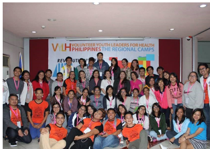
Group photo of NCR-South Luzon Regional Camp of Volunteer Youth Leaders for Health - Philippines participants and facilitators

The following day, the program began with a morning exercise to pump up the participants and also the facilitators. Afterwards, the event proceeded with talks about Social Media and The Filipino Youth Volunteer. On the afternoon, the event was closed with performances from the participants and facilitators then the conic awarding that made a memorable and fun ending for all. Finally, the participants were encouraged to cascade the learnings as they return to their respective area.