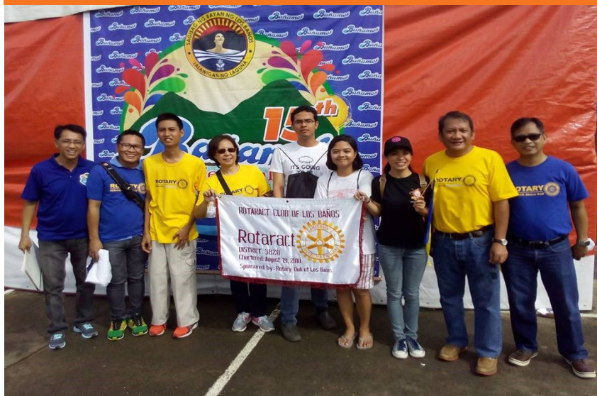
Rotarians of RCLB with the Rotaractors who joined the annual Civic Parade

LOS BAÑOS, LAGUNA —As one of the club's regular Public Relations Activity, the Rotaract Club of Los Baños (RACLB) participated in the annual Bañamos Civic Parade headed by the Los Baños Municipality last September 16, 2016. RACLB, together with the Rotary Club of Los Baños (RCLB) and the Interact Club of Los Baños National High School (IC-LBNHS) as well as all the organizations and institutions within the Los Baños community. The parade assembled at the Olivarez Plaza at 6am and the parade started about one hour later.