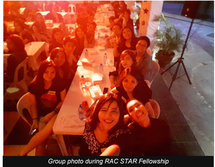
Group photo during RAC STAR Fellowship

Beside the induction ceremonies, attendees also enjoyed the Rock and Roll vibe of the event through performances of live band and of Rotaractors themselves.