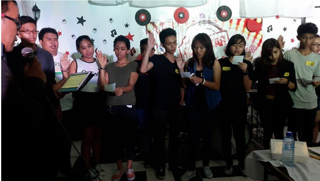
Oath-taking of new Rotaractors from Laguna area lead by one of the RCSO Youth Committee

CALAMBA CITY —Last September 17-18, 2016, the Laguna Area Mass Induction ceremonies themed “RAC STAR” was held at Celebration Springs Resort, Park Merced Village, Los Baños, Laguna. As one of the clubs in Laguna, the Rotaract Club of Los Baños’ “All Star” inductees were charged and took oath before Rotarians and Rotaract District Officers. Continued in page 5.