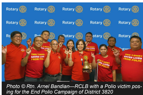
Photo © Rtn. Arnel Bandian—RCLB with a Polio victim posing for the End Polio Campaign of District 3820

In addition, RACLB and RCLB patronized the RI District 3820's End Polio shirts and polo-shirts campaign. Their purchases were sported by each in their posted photos. Funds raised on the campaign will be donated directly to the Rotary International.