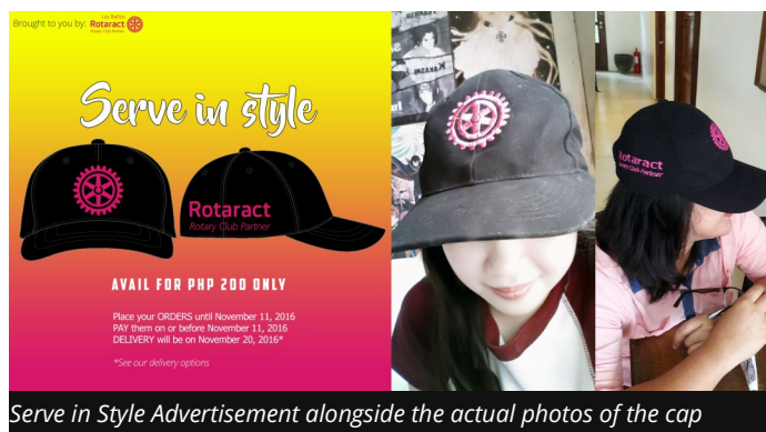
Serve in Style Advertisement alongside the actual photos of the cap

Different Rotaract and Interact clubs bought the caps, as well as some Rotarians. Rotaract caps, Interact caps and Rotary caps were sold at ₱ 200, ₱ 175 and ₱ 250, respectively.