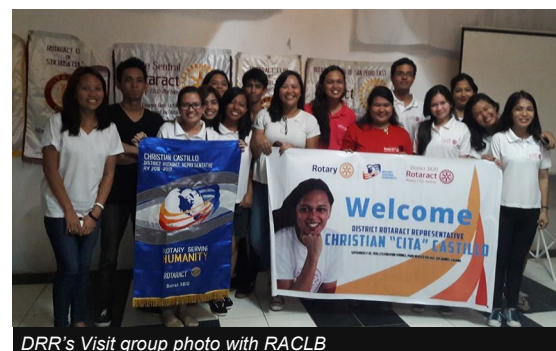
DRR's Visit group photo with RACLB

The friendship agreement with RAC Metro San Pedro is the fourth signed by RACLB this Rotary year. Prior to this, RACLB already signed similar agreements with the Rotaract Clubs of Cavinti, San Pedro South and Santa Rosa Centro.