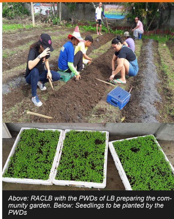
Above: RACLB with the PWDs of LB preparing the community garden. Below: Seedlings to be planted by the PWDs

The project will continue until the vegetables can finally be harvested and consumed by the PWDs. The project was launched to help the members of the Persons with Disability organization in Los Baños to have a free source of vegetables and additional income. It also served as a jump starter for RCLB’s annual Home Gardening project which will be held on November 26, 2016 in Brgy. Bambang, Los Baños, Laguna.