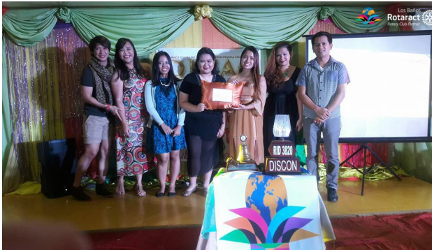
RACLB brought home the Major award: Bronze Awardee—Community-based in the DICAC 2016 at La Virginia Resort, Mataas na Kahoy, Batangas

The annual District Conference and Awarding Ceremony (DICAC) was held at La Virginia Resort, Mataas na Kahoy, Batangas last April 15-17 2016. The event was attended by approximately 60 participants from the different clubs of Rotaract within