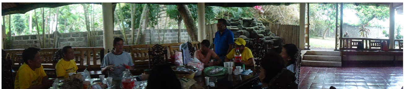
RCLB and RACLB enjoying a casual talk during the fellowship

himself/herself and the rest of the group will try to guess whether it's true or false. The goal is for the person in front to fool as many members as he/she can. It was a fun game knowing personal stories from the members of our sponsoring club. Lunch time came and the group had a good talk about the things going on with each members. The team building ended up with a Pinoy Henyo game. Even though not all Rotarians were present due to work conflicts, they intend to do these things more often especially for the next rotary year.